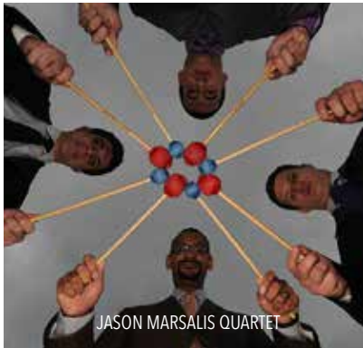
JASON MARSALIS QUARTET