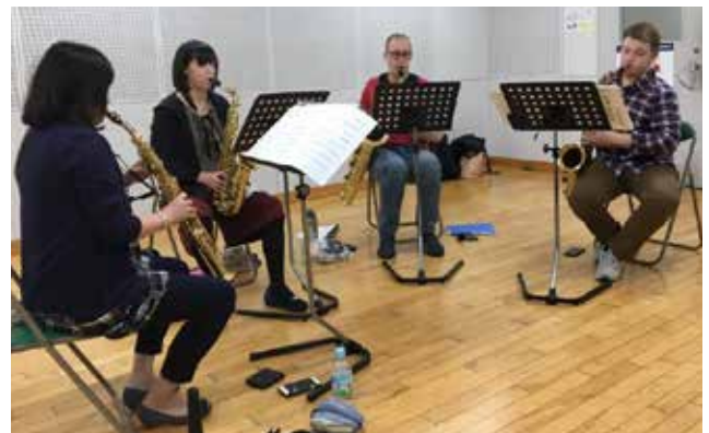
Snow Pond Saxophone Quartet